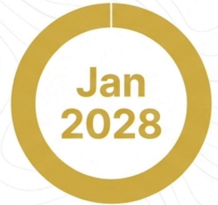
Personal Income Tax (Forecast)

On tobacco, energy drinks, specific goods.